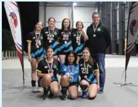
U17 Girls Blue